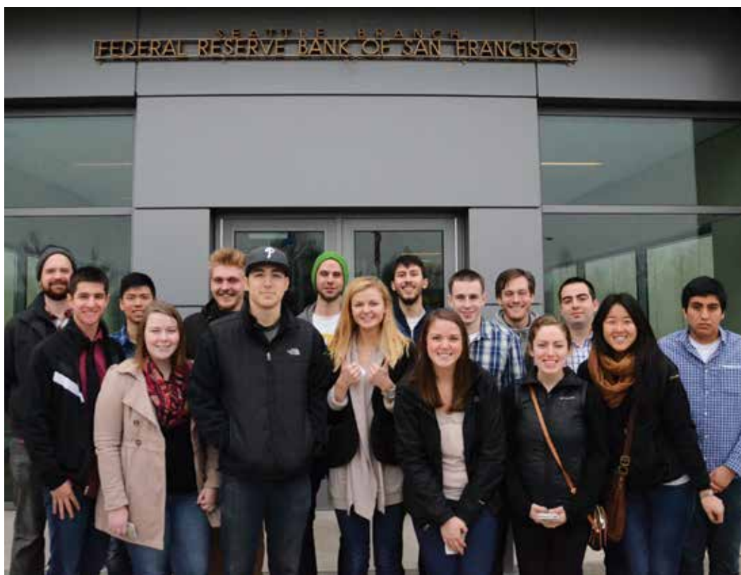
UO Economics Club at the Federal Reserve Bank branch in Seattle during winter term 2014

The University of Oregon Economics Club, supported by Career and Advising Services, entered the sophomore year of its existence and increased its membership significantly.